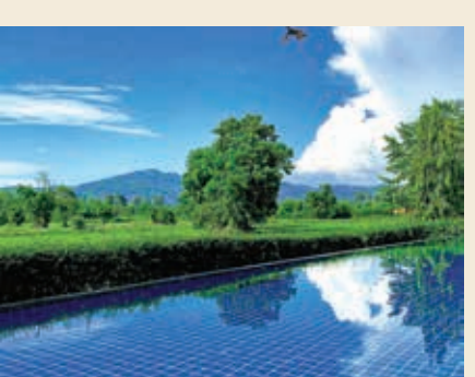
Environment 32% Waste segregation rate