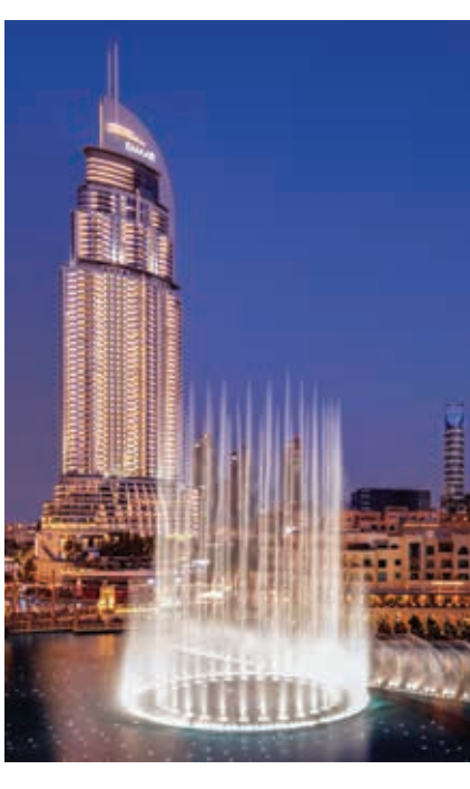
Dubai Fountain Largest choreographed fountain