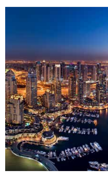
Dubai Marina Largest man-made Marina